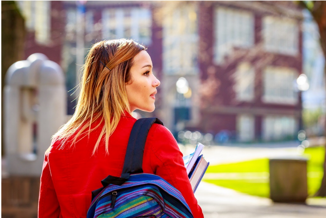
Post secondary education